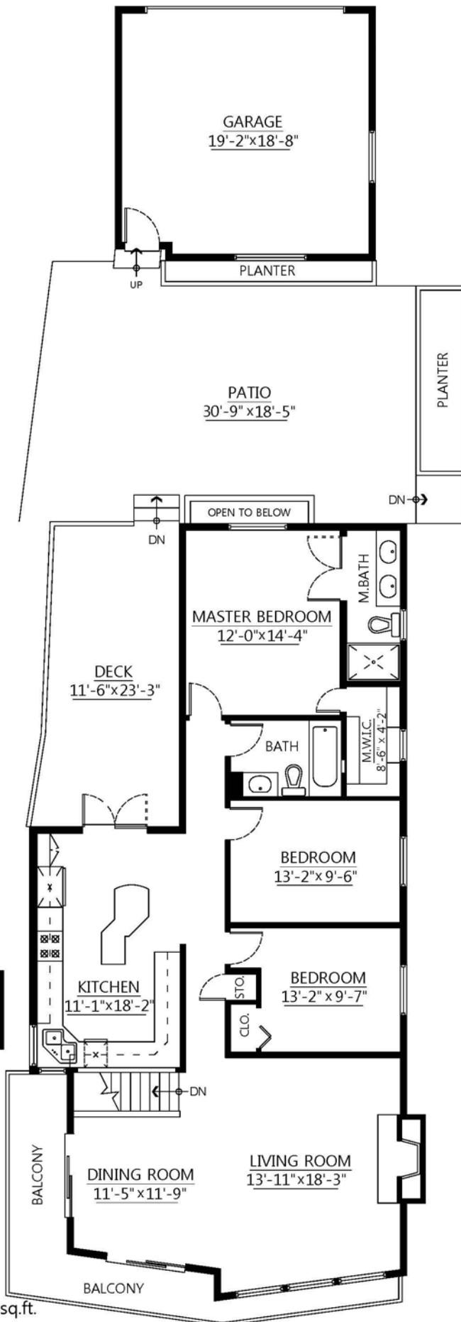
Main Floor Plan Floor Area: 1,388 sq.ft.